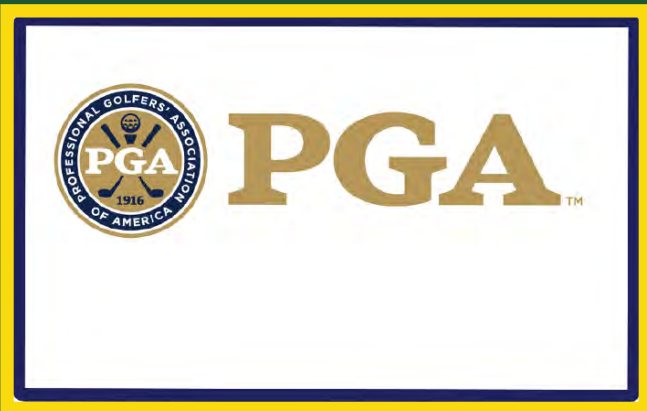
PGA COMING JUNE 2022