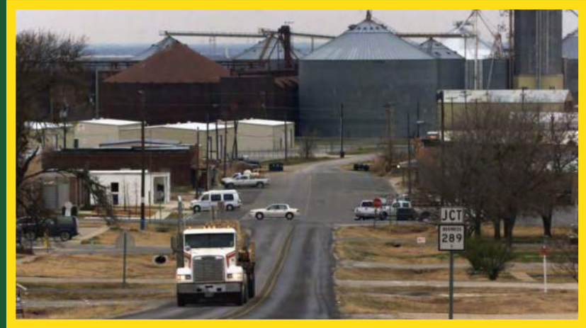
SOME OF PROSPER'S SIGNATURE SILOS ARE COMING DOWN FOR FUTURE DEVELOPMENT